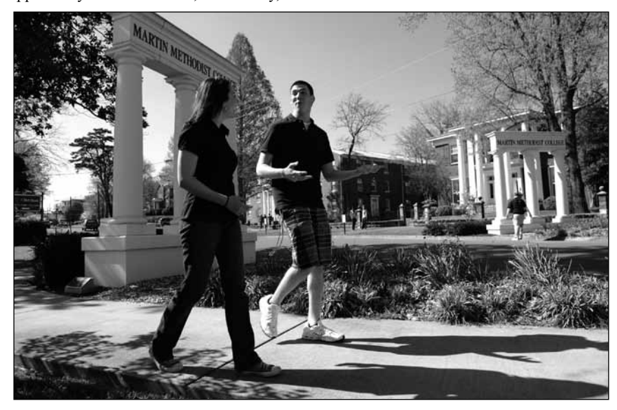
MMC's campus is located in the Westhill Historic District of Pulaski.

Martin Methodist College is committed to being the educational epicenter for south central Tennessee and a college of opportunity for our students, community, and church.