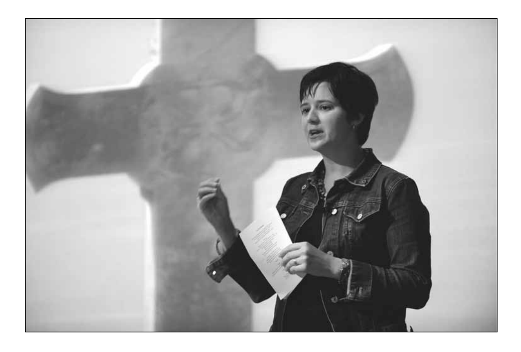
The religious life activities on campus offer opportunities for Christian Ed. majors.