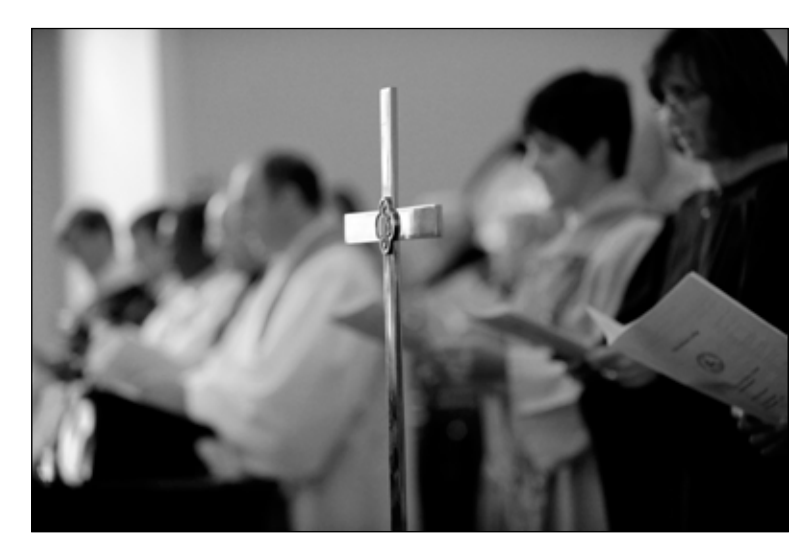
Church music is an emphasis in the Church Vocations major.