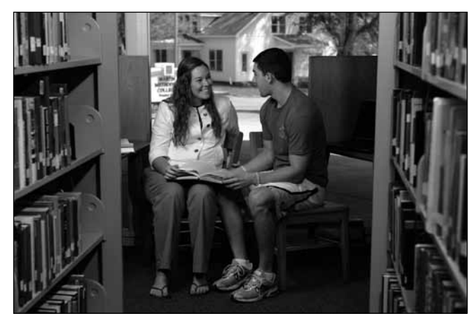
Students study together at Warden Memorial Library.

ACT scores and/or placement scores (COMPASS) for first-year students shall be evaluated to determine placement in reading, writing and mathematics classes. Placement in writing classes shall also be determined through a diagnostic essay administered and evaluated by members of the English faculty. Should a student dispute his/her placement in one of these classes, the objection must be submitted in writing to the Program Coordinator for English within one week of the placement, upon which time a second diagnostic essay shall be scheduled. This essay will be evaluated by three independent members of the English faculty. Final placement in ENG 099 or ENG 100 is mandatory. A student placed in a Developmental Reading, Writing, or Mathematics class at any level must successfully complete the sequence of developmental courses before advancing to a college-level class in those academic areas.