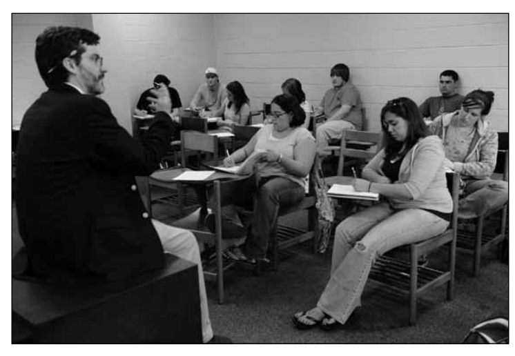
History is one of the majors in the Division of Social Sciences.