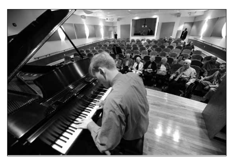
The Gault Fine Arts Center offers students a venue for music, art, lectures, and special ceremonies.

This course covers selected topics and readings that are related to the student's area of study. Permission of the instructor and the Vice-President for Academic Affairs is required before registration. Prerequisite: Senior classification. Offered on demand.