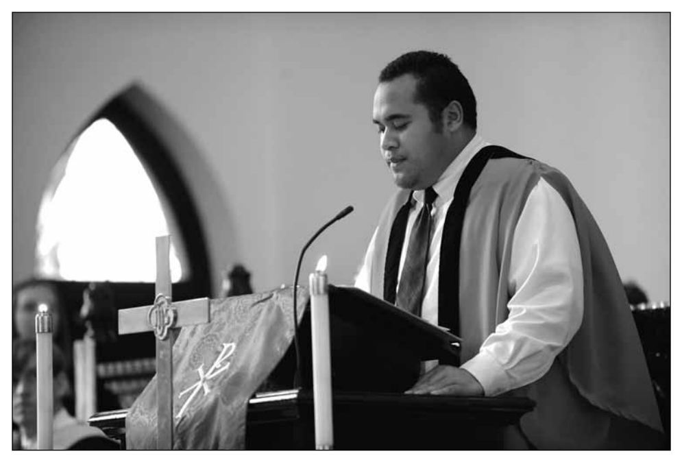
MMC students have opportunities to gain valuable worship leadership experience.