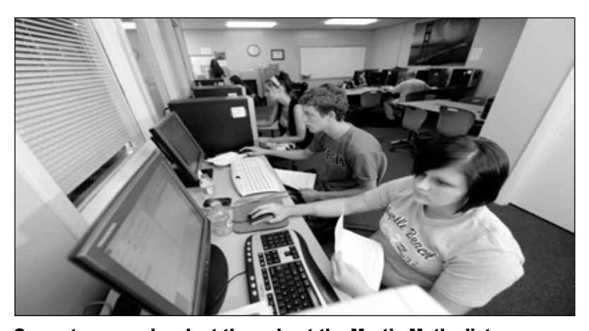
Computers are abundant throughout the Martin Methodist campus.