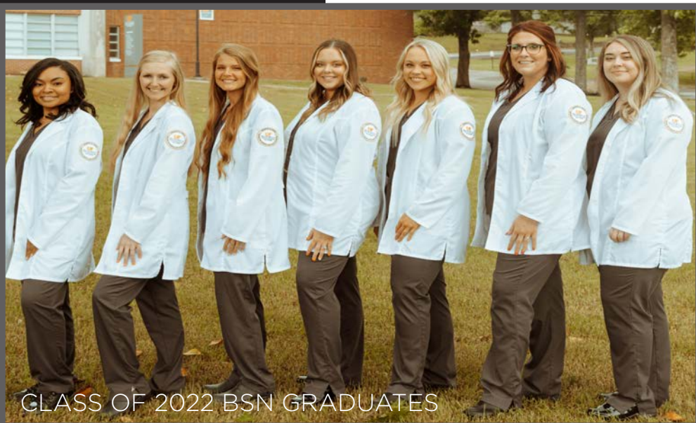
CLASS OF 2022 BSN GRADUATES