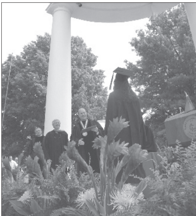
Each graduate enjoys a triumphant walk across the Grissom Gazebo stage.