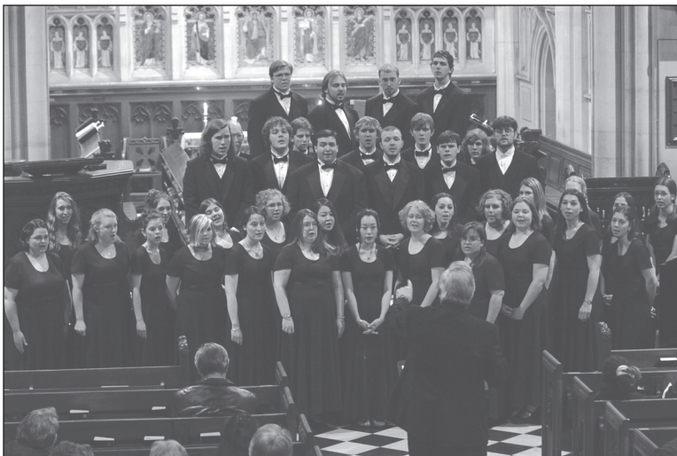
The college’s concert choir is one of the many music-related opportunities available on campus.