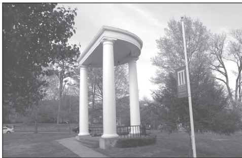
Grissom Gazebo stands sentry on the Campus Green.

Martin Methodist College is committed to being one of the leading, small, nurturing liberal arts colleges in the Southeast, and a model of church-relatedness for the United Methodist Church.