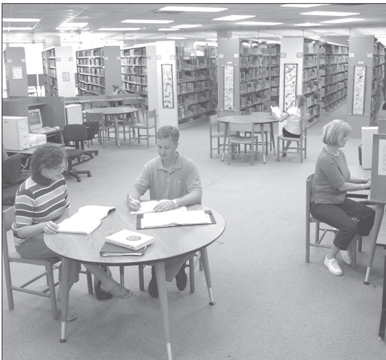
Students congregate in Warden Memorial Library, located on the ground floor of Johnston Academic Center.

All veterans must submit a copy of the D.D. Form 214 as part of their admissions process. Credit toward a degree may be granted to those students whose D.D. Form indicates a period of continuous active duty for at least 90 days. Two semester hours will be granted for basic training or its equivalent, and it will be considered as credit in physical education. Additional credit for training in formal service schools will be granted on the basis of recommendations published in “A GUIDE TO THE EVALUATION OF EDUCATIONAL EXPERIENCES IN THE ARMED SERVICES” or the recommendations of the Commission on Accreditation of Service Experiences insofar as the recommended credit can be evaluated as equivalent to a specific Martin Methodist College course.