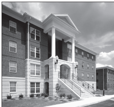
The student apartments opened in January 2005.

Freshmen male students at the College are housed in Upperman Hall. Each room is furnished with bed, chest of drawers, closets, study desk with Internet port, and chair. Telephone connections with voice mail capability are provided in each room. The rooms are also provided with window blinds. Each room has a separate thermostat control for heating and air conditioning. In addition, the building has a student lounge with a television, a small private chapel, and a laundry room.