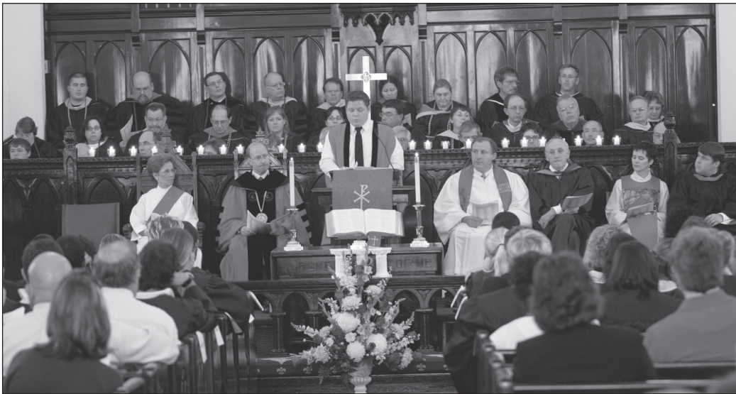
Opportunities abound for students to take part in church-related activities and events on campus, including the baccalaureate service, held as part of commencement.