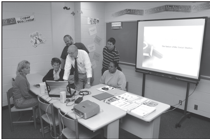
Technology is an important part of the learning experience at Martin Methodist College.