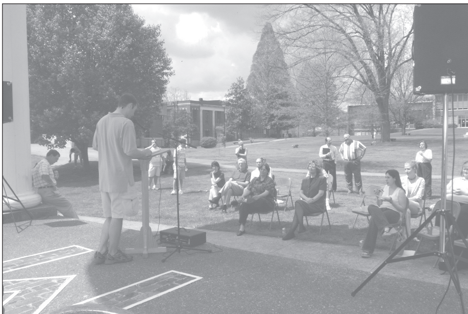
A spring day might result in a reading of original work by students in a poetry class, complete with pizza and soft drinks at the Grissom Gazebo.

For Secondary Teacher Certification In English: See Division of Education