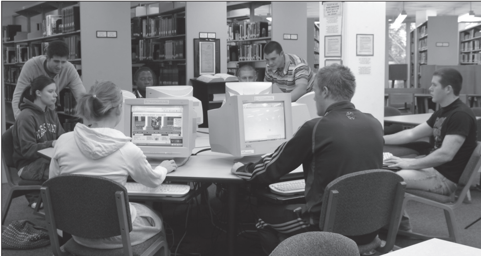
The campus has a growing network of computers in classrooms, study labs, and in the library (above).