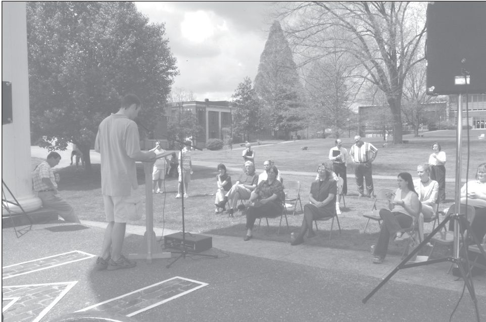
A spring day might result in a reading of original work by students in a poetry class, complete with pizza and soft drinks at the Grissom Gazebo.

For Secondary Teacher Certification In English: See Division of Education