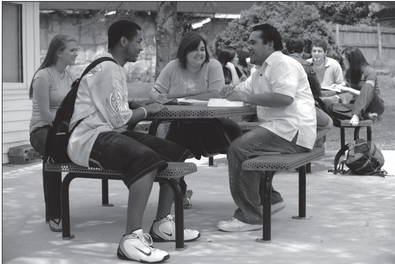
An important part of campus life is interaction outside of the classroom, such as study groups outside on a warm, spring day.