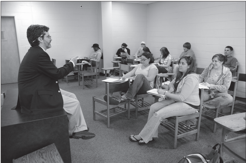
The quality of MMC's academic program is constantly being assessed and evaluated.

Students may be required to complete one or more questionnaires or surveys and to take one or more standardized tests to determine general educational achievement or overall knowledge of one's major field as a prerequisite to graduation. The results of such testing will be used to assess overall program effectiveness and to enhance program quality in the future. Unless required in a particular program, no minimum score or level of achievement is required for graduation. Failure of students to participate in such testing, or to take the test and perform in a frivolous manner, will result in some form of sanction including fines, suspension, and/or failure to graduate, or a lesser penalty until such tests are completed properly.