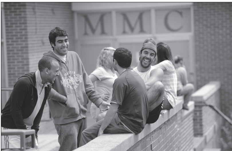
Fun and good friendship figure in to all parts of the MMC experience.

Total Number of Hours Required ..... 121