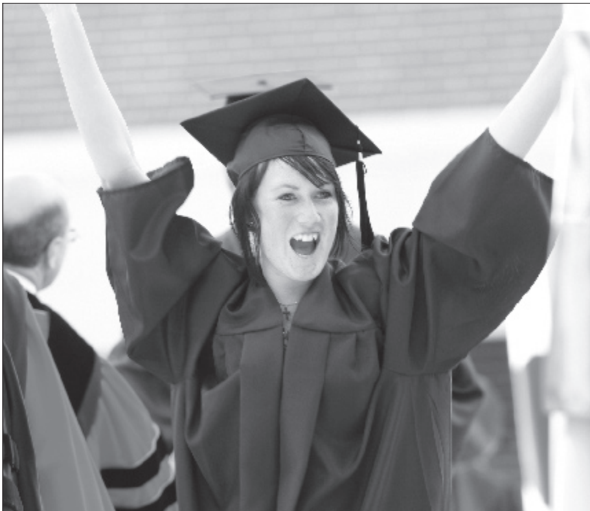
The hard work and long hours of study all come together when a Martin Methodist College student receives a baccalaureate degree in the spring.