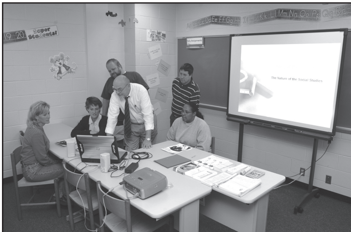
Technology is an important part of the learning experience at Martin Methodist College.