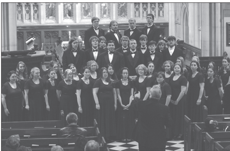
The College's concert choir is one of the many music-related opportunities available on campus.