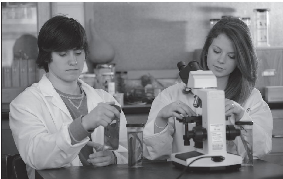
ACT scores and placement scores help determine first-year students' courses.

ACT scores and/or placement scores (COMPASS) for first-year student shall be evaluated to determine placement in reading, writing, and mathematics classes. Placement in writing classes shall also be determined through a diagnostic essay administered and evaluated by members of the English faculty. Should a student dispute his/her placement in one of these classes, the objection must be submitted in writing to the Program Coordinator for English within one week of the placement, upon which time a second diagnostic essay shall be scheduled. This essay will be evaluated by three independent members of the English faculty. Final placement in ENG 099 or ENG 100 is mandatory. A student placed in a Basic Reading, Writing, or Mathematics class at any level must successfully complete the course or courses before advancing to a college-level class in those academic areas.