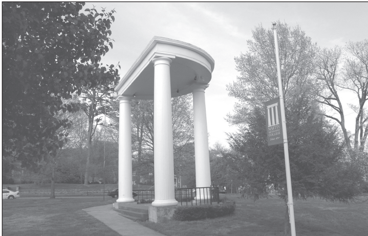
Grissom Gazebo stands sentry on the Campus Green.

Martin Methodist College is committed to being one of the leading small, nurturing, liberal arts colleges in the Southeast and a model of church-relatedness for the United Methodist Church.